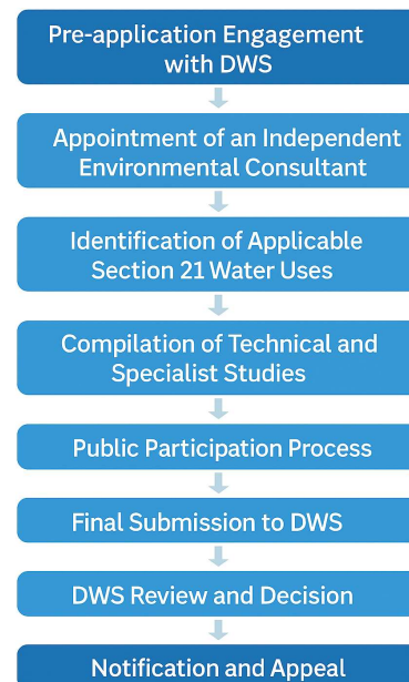
Figure 1: Key steps form part of the WULA process