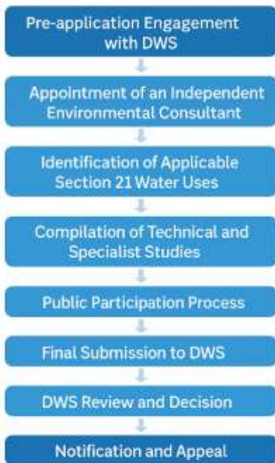
Figure 1: Key steps form part of the WULA process