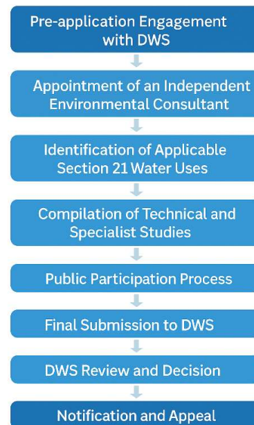
Figure 1: Key steps form part of the WULA process